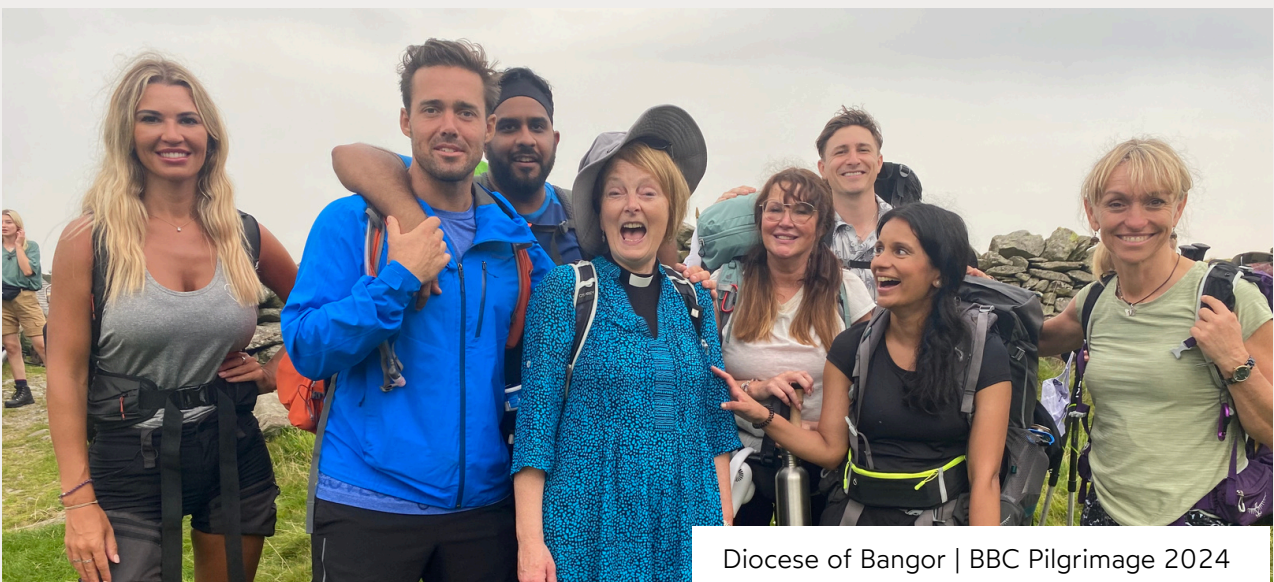
Diocese of Bangor | BBC Pilgrimage 2024

We welcome you to join us in this transformative mission, as we navigate the challenges of our time with faith, dedication, and a commitment to worship, growth, and love.